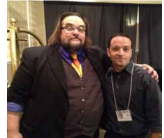
Then we were in Myrtle Beach